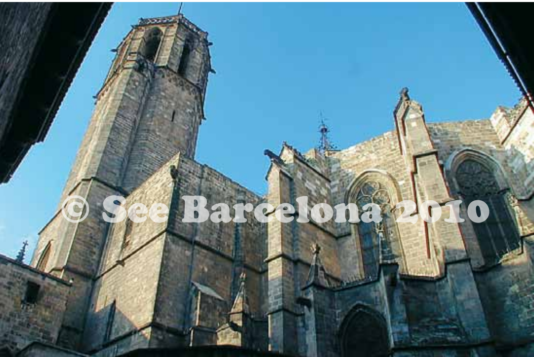
Barcelona's Cathedral: exterior of ambulatory and belfry

Considered by many to be the most perfect example of Catalan Gothic architecture, it's harmonious interior boasts excellent acoustics that make it a preferred concert venue. Begun in 1329 by Berenguer de Montagut, and completed in 1383, this church was built during the height of Catalan overseas expansion. In July of 1936, during the Spanish Civil War a fire destroyed much of the interior.