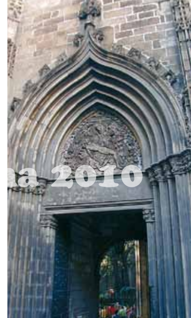
Portal de la Pietat