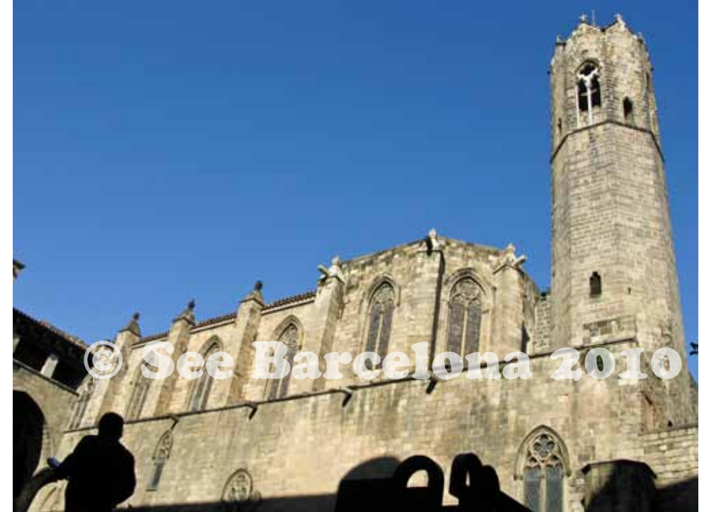
St. Agatha Chapel