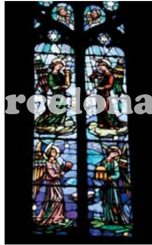
Cathedral stained glass