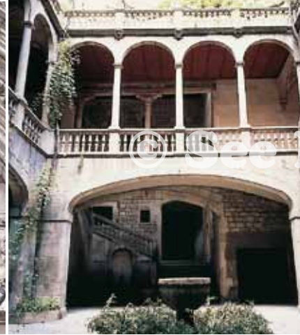
Palau del Lloctinent.