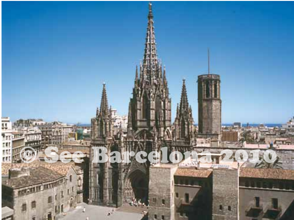
Barcelona's Cathedral.

This was the residence of the 16th century canons and has recently had a complete rehabilitation.