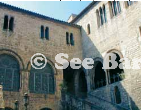
Palau Episcopal (Bishop's Palace) courtyard