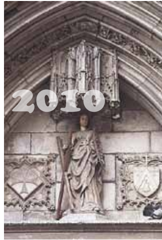
Santa Eulalia portal